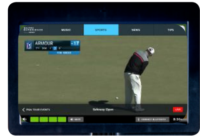
Club Car Connect with Shark Experience